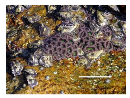
Figure 3: Colonies of Zoanthus pulchellus at the rocky shore in the Hidden Twin Beach, Cape Comorin Point, Kanyakumari