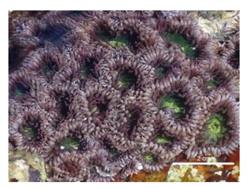
Figure 4: Magnified view of Zoanthus pulchellus showing oral disc and arrangement of tentacles